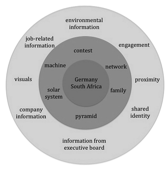
Figure 1: Theoretical Model (scheme) of the Organisational Culture of International Companies Depicted through Employee Magazines

Research applied a case study design analysing the Volkswagen international company headquartered in Germany with a subsidiary in South Africa. The data collection instrument was four employee magazines published by the two companies. The data analysis instrument applied a qualitative content analysis to analyse the written material. The sample included all