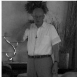
Figure 6. Head movement and gesture co-expressed with can also