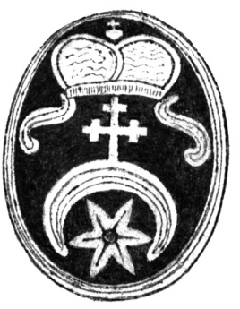
Supralibres with the Vyshnivetskies coat of arm "Korybyth"