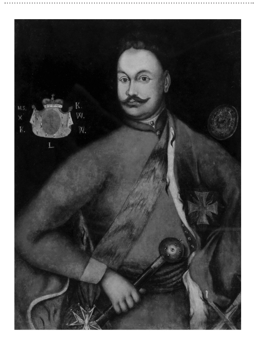
Portret of M. S. Vyshnevecky. Oil in canvas. An unknown artist of the mid XVIIIth century. (Volyn Ethnographic Museum. Luck. Ukraine)

14. Portret of M. S. Vyshnevecky. Oil in canvas. An unknown artist of the mid XVIIIth century. (Volyn Ethnographic Museum. Luck. Ukraine).