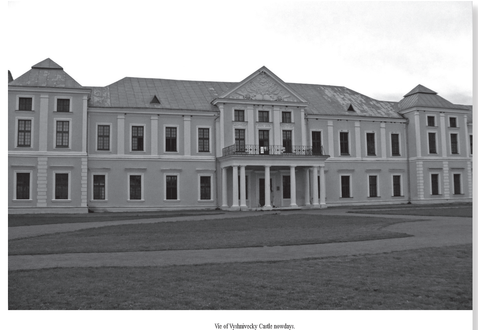
Vie of Vyshnivecky Castle nowdays. Photograph from the Auther. September 2012

20. Vie of Vyshnivetsky Castle nowdays. Photograph from the Auther. September 2012.