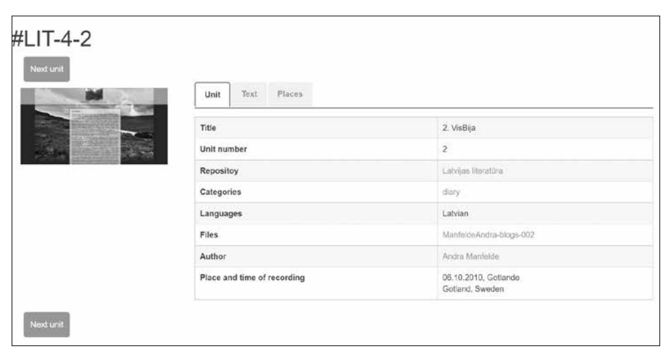
FIGURE No. 4. The structure of a unit of Andra Manfelde's blog in Literatura.lv.

or is removed. Such a fate has befallen several Latvian writers' blogs, including Andra Manfelde's blog, whose entries posted on a blogging platform, Posterous , currently can only be retrieved from the Internet Archive, WayBackMachine . With the author's permission, we placed the blog on Literatura.lv, <sup>16</sup> structured it by separating every entry as a unit of the digital diary (Text), and arranged all the places mentioned in the text (Places) for the future research.