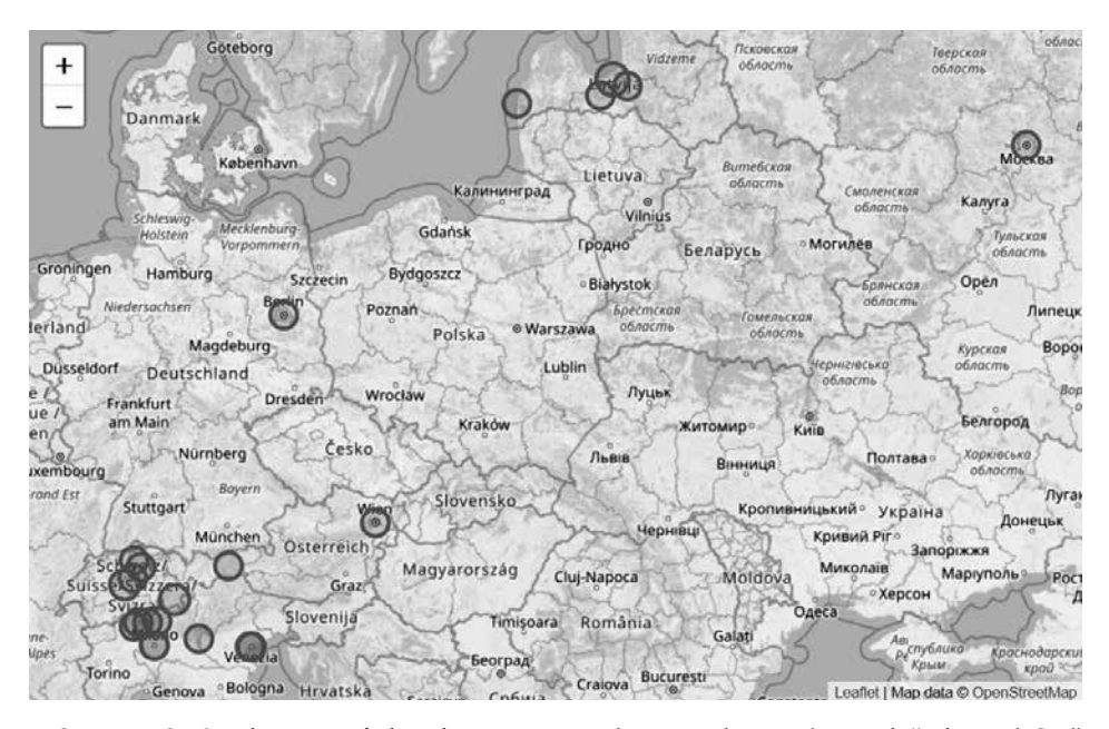
FIGURE NO. 3. The map of the places mentioned in Ivande Kaija's novel "Inherited Sin" (Iedzimtais grēks, 1913).

Literature and Music, and many regional museums, which have compiled and have available data resources, suited to integrate in Literatura.lv, has been developed. In addition, it is worth noticing that lately, people have intensively begun investigating their family's histories, using biographical data harvesting to make their digital family tree. Thus, it provides additional data for wider use beyond the individual or family research.<sup>15</sup>