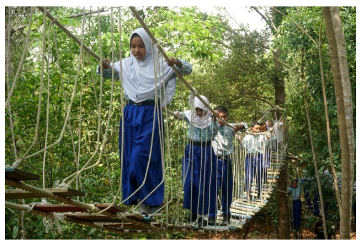
Figure 1: School children at the Peat Arboretum

Company communication by fostering farmer groups and connecting with other groups or stakeholders is very effective in overcoming the problem of peatland and forest fires. The CSR program to overcome peatland fires in Bukit Batu District is also carried out by facilitating the community in the development and use of land that was burned in the area. Burnt-prone and abandoned areas are converted into pineapple farming areas, followed by providing training on pineapple product processing and other supporting entrepreneurship training (see Figure 2).