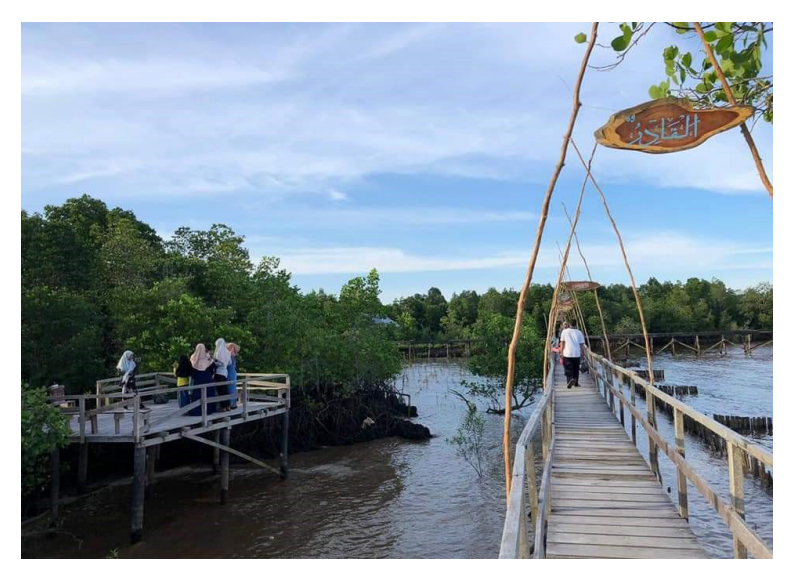
Figure 4: One of spots at the mangrove ecotourism (Source: facebook.com/mangrovepangkalanjambi)

Figure 3: Installation of Mangrove Ecotourism Directions (Source: facebook.com/mangrovepangkalanjambi)