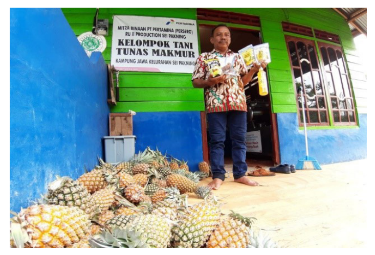
Figure 2: Farmer with agricultural products and processed pineapple

Figure 1: School children at the Peat Arboretum