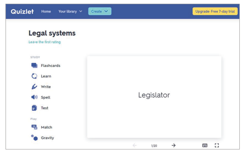
Figure 1. Options for vocabulary learning provided by Quizlet

As soon as we teach our students legal English, the academic staff of the department created flash-cards with legal terms on conversational topics in accordance with the curriculum.