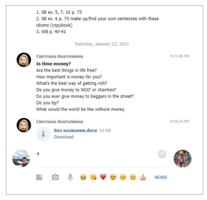
Figure 5. Fragment of correspondence of teacher of the department with her students

In Figure 5 you can see students' home assignment from text-books and questions for making dialogues, composed by the authors.