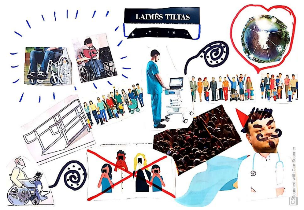
Fig. 2. Collage of the second group, The Bridge of Happiness

The second collage was created by the students of radiology. To make the collage, the research participants used 15 pictures. Also, as in the case of the first collage, connections were drawn with colourful markers, and symbols were used to emphasise the thought expressed. Even though only five symbols were used, the meanings conveyed through them is more varied: heart (love), dashes in a circle (attention, shining), crossing lines (an unsuitable approach), a dot-decorated twist (related to other images). The picture is called The Bridge of Happiness (Fig. 2).