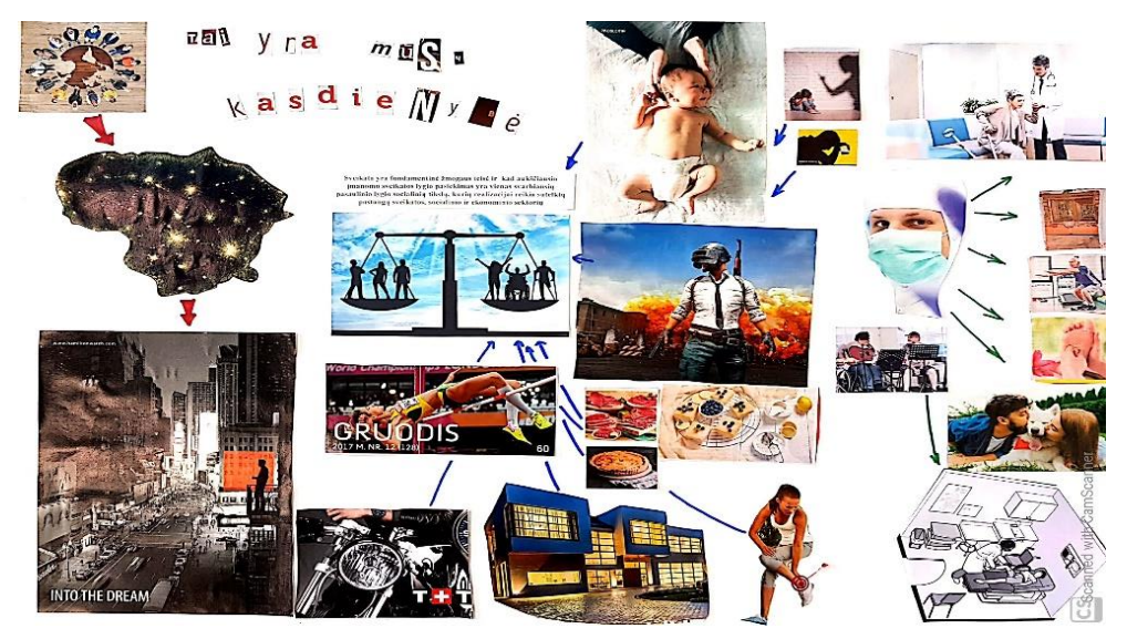
Fig. 1. Group 1 collage called This is our Everyday Life

The creation of the first collage made by 3 students of the physiotherapy study programme included 24 pictures. Connections were revealed through 12 arrows. Even though there was no task given to name the work, the students used letters to spell the name reflecting the idea of the collage This is our Everyday Life (Fig. 1).