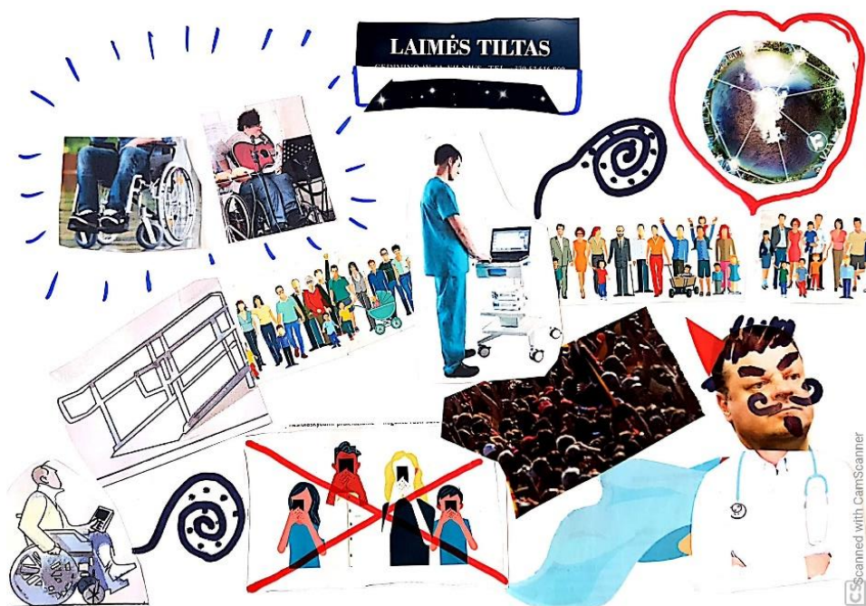
Fig. 2. Collage of the second group, The Bridge of Happiness

The second collage was created by the students of radiology. To make the collage, the research participants used 15 pictures. Also, as in the case of the first collage, connections were drawn with colourful markers, and symbols were used to emphasise the thought expressed. Even though only five symbols were used, the meanings conveyed through them is more varied: heart (love), dashes in a circle (attention, shining), crossing lines (an unsuitable approach), a dot-decorated twist (related to other images). The picture is called The Bridge of Happiness (Fig. 2).