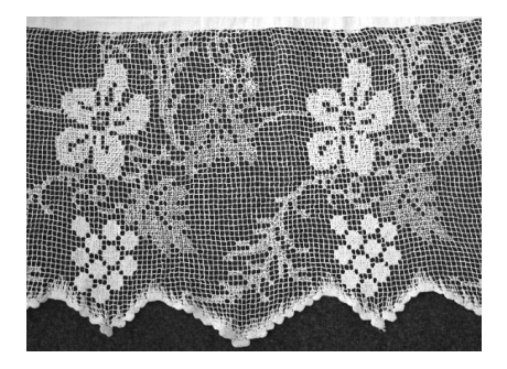
Fig. 6. Embroidered alb. Embroidered netting h – 35 cm. Vārkava.