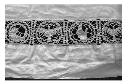
Fig. 9, 10. Embroidered alb. Richelieu technique h – 30 cm; 9 cm. Krustpils.