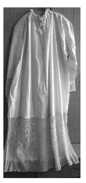
Fig. 1. Alb at the Catholic Church in Krustpils.