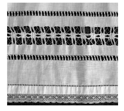
Fig. 5. Embroidered alb. White open work h –7 cm. Šķilbēni.

• When sewing machines enter into use (like Singer, Imperial, Grower, etc.), decorative stitching is richly sewn with them.