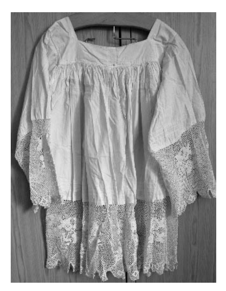
Fig. 2. Surplice at the Catholic Church in Krustpils.

It is remarkable that the cut of alb is identical to the cut of peasants' shirts.