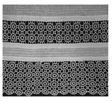
Fig. 7, 8. Albs adorned with crocheted lace h - 19.5 cm and h - 9 cm; 14 cm. Augustova, Vārkava.