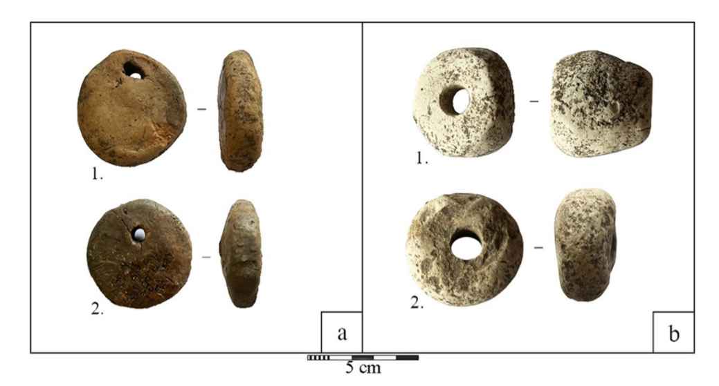
Fig. 2. (a) – possible clay weights, (b) – possible stone weights. (a) (1, 2) found at Nevieriškės fortified settlement (i.e., hillfort); (b) (1, 2) found at Narkūnai fortified settlement (i.e., hillfort). These findings are preserved at the National Museum of Lithuania.

2 pav. a – moliniai galimi pasvarai, b – akmeniniai galimi pasvarai. a (1, 2) rasti Nevieriškės įtvirtintoje gyvenvietėje; b (1, 2) – Narkūnų įtvirtintoje gyvenvietėje. Šie radiniai saugomi Lietuvos nacionaliniame muziejuje.