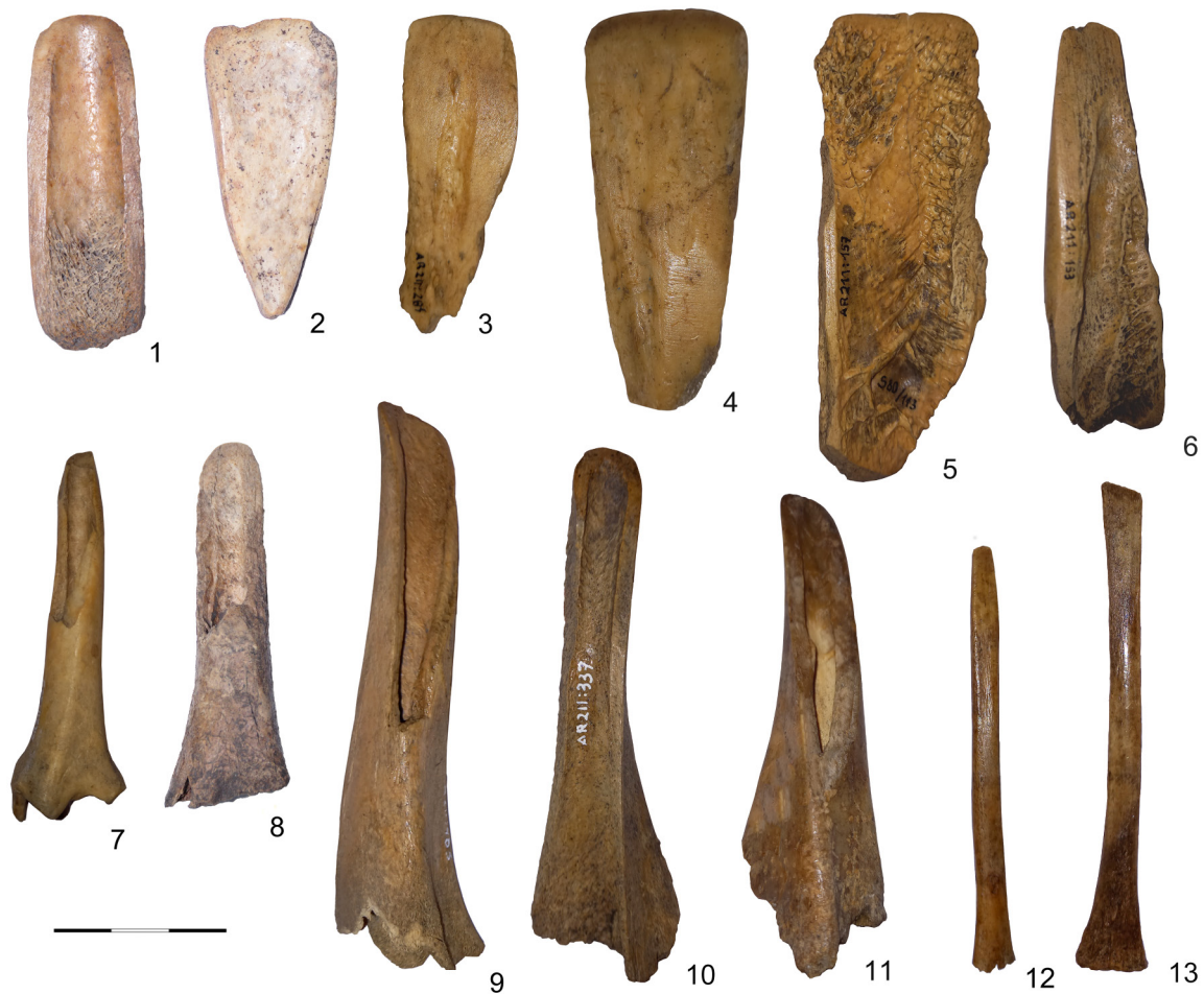
Fig. 5. Bone chisels and scrapers from Mineikiškės (1–2, 8) and Sokiškiai (3–7, 9–13). Materials: 1–2, 4–6 – large ungulate long bone; 3 – elk metapodia; 7 – sheep/goat tibia; 8 – pig humerus; 9–11 – pig tibia; 12–13 – pig fibula (LNM Mnk 20: 247, 251, LNM AR 211: 284, 281, 157, 153, 339, LNM Mnk 20: 224, LNM AR 211: 463, 337, 331, 299, 294).

5 pav. Kauliniai kalteliai ir gremžtukai iš Mineikiškių (1–2, 8) ir Sokiškių (3–7, 9–13). Žaliava: 1–2, 4–6 – stambių kanopinių gyvūnų ilgieji kaulai; 3 – briedžio metapodija; 7 – avies / ožkos blauzdikaulis; 8 – kiaulės petikaulis; 9–11 – kiaulės blauzdikaulis; 12–13 – kiaulės šėvikaulis (LNM Mnk 20: 247, 251, LNM AR 211: 284, 281, 157, 153, 339, LNM Mnk 20: 224, LNM AR 211: 463, 337, 331, 299, 294).