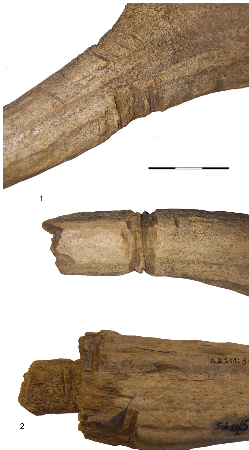
Fig. 12. Working traces on antler objects from Sokiškiai (LNM AR 211: 387 (2), 514). 12 pav. Darbo žymės ant raginių dirbinių iš Sokiškių (LNM AR 211: 387 (2), 514).