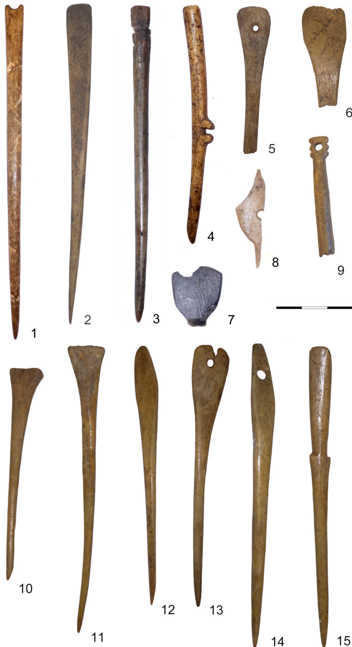
Fig. 7. Bone pins from Garniai I (1), Mineikiškės (2–8), Sokiškiai (9–15). Materials: 1–4, 6–9, 12–15 – large ungulate long bone; 5, 10–11 – pig fibula (LNM AR 997: 17, LNM Mnk 17: 40, Mnk 20: 260, Mnk 17: 31, 1, 14, Mnk 20: 249, 236, LNM 211: 417, 117, 409, 213, 219, 402, 416).

7 pav. Kauliniai smeigtukai iš Garnių (1), Mineikiškių (2–8), Sokiškių (9–15). Žaliava: 1–4, 6–9, 12–15 – stambaus kanopinio ilgasis kaulas; 5, 10–11 – kiaulės šėivikaulis (LNM AR 997: 17, LNM Mnk 17: 40, Mnk 20: 260, Mnk 17: 31, 1, 14, Mnk 20: 249, 236, LNM 211: 417, 117, 409, 213, 219, 402, 416).