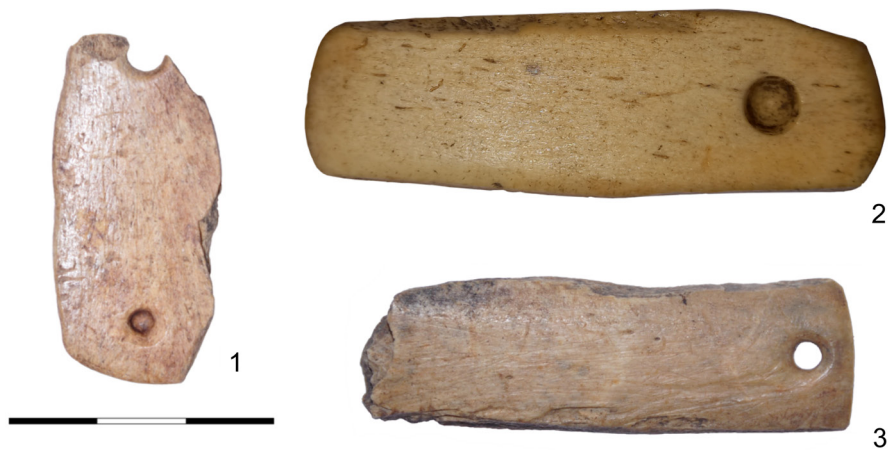
Fig. 16. Bone artefacts with finished and unfinished holes from Mineikiškės (1, 3) and Sokiškiai (2), all made of large ungulate long bones (LNM Mnk 20: 234, LNM AR 211: 169, LNM Mnk 20: 226).

15 pav. Kauliniai dirbiniai su baigtomis ir nebaigtomis daryti skylėmis iš Sokiškių. Dirbiniai pagaminti iš stambių kanopinių gyvūnų kaulų (LNM AR 211: 173, 172, 391, 394).