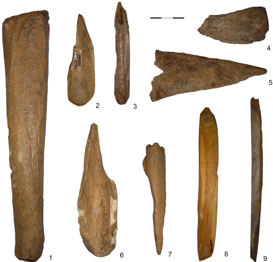
Fig. 10. Bone working waste and unfinished bone items from Sokiškiai. Materials: 1–3, 6–9 – long bones; 4–5 – flat bones (LNM AR 211: 384, 160, 161, 276, 381, 380, 356, 293, 291).

10 pav. Kaulo apdirbimo atliekos ir nebaigti gaminti dirbiniai iš Sokiškių. Žaliava: 1–3, 6–9 – ilgieji kaulai; 4–5 – plokštieji kaulai (LNM AR 211: 384, 160, 161, 276, 381, 380, 356, 293, 291).