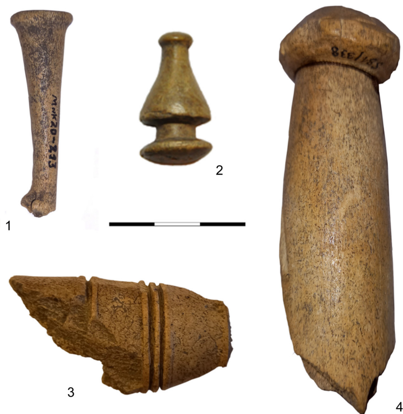
Fig. 3. Antler artefacts from Mineikiškės (1), Garniai I (2), Sokiškiai (3–4). 1 – fragment of a pin (LNM Mnk 20: 213); 2 – double button (LNM AR 997: 3); 3, 4 – fragments of handles (LNM AR 211: 505, 308).

3 pav. Rago dirbiniai iš Mineikiškių (1), Garnių (2), Sokiškių (3–4). 1 – smeigtuko fragmentas (LNM Mnk 20: 213); 2 – dviguba sagutė (LNM AR 997: 3); 3, 4 – rankenų fragmentai (LNM AR 211: 505, 308).