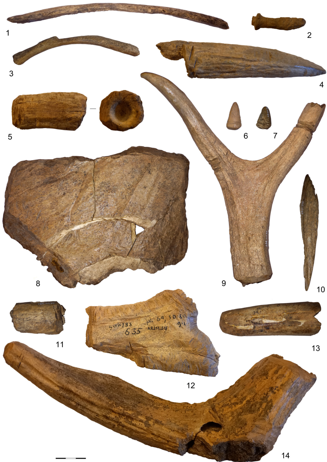
Fig. 4. Antler waste from Sokiškiai (LNM AR 211: 490, 497, 115, 514, 192, 166, 388, 194, 387, 359, 382, 515, 374, 516).

4 pav. Rago apdirbimo atliekos iš Sokiškių (LNM AR 211: 490, 497, 115, 514, 192, 166, 388, 194, 387, 359, 382, 515, 374, 516).