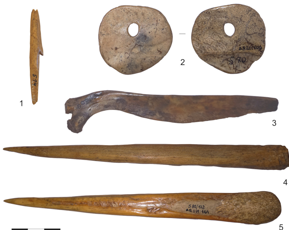
Fig. 9. Bone artefacts from Sokiškiai. 1 – arrowhead made of unidentified long bone; 2 – disc made of ungulate scapula; 3 – knife made of unidentified rib; 4–5 – daggers made of unidentified long bone and elk metapodia (LNM AR 211: 475, 506, 500, 364, 164).

9 pav. Kauliniai dirbiniai iš Sokiškių. 1 – antgalis iš ilgojo kaulo; 2 – skridinys iš kanopinio gyvūno mentės kaulo; 3 – peilis iš gyvūno šonkaulio; 4–5 durklai iš tiksliau neidentifikuoto ilgojo kaulo ir briedžio metapodijos (LNM AR 211: 475, 506, 500, 364, 164).