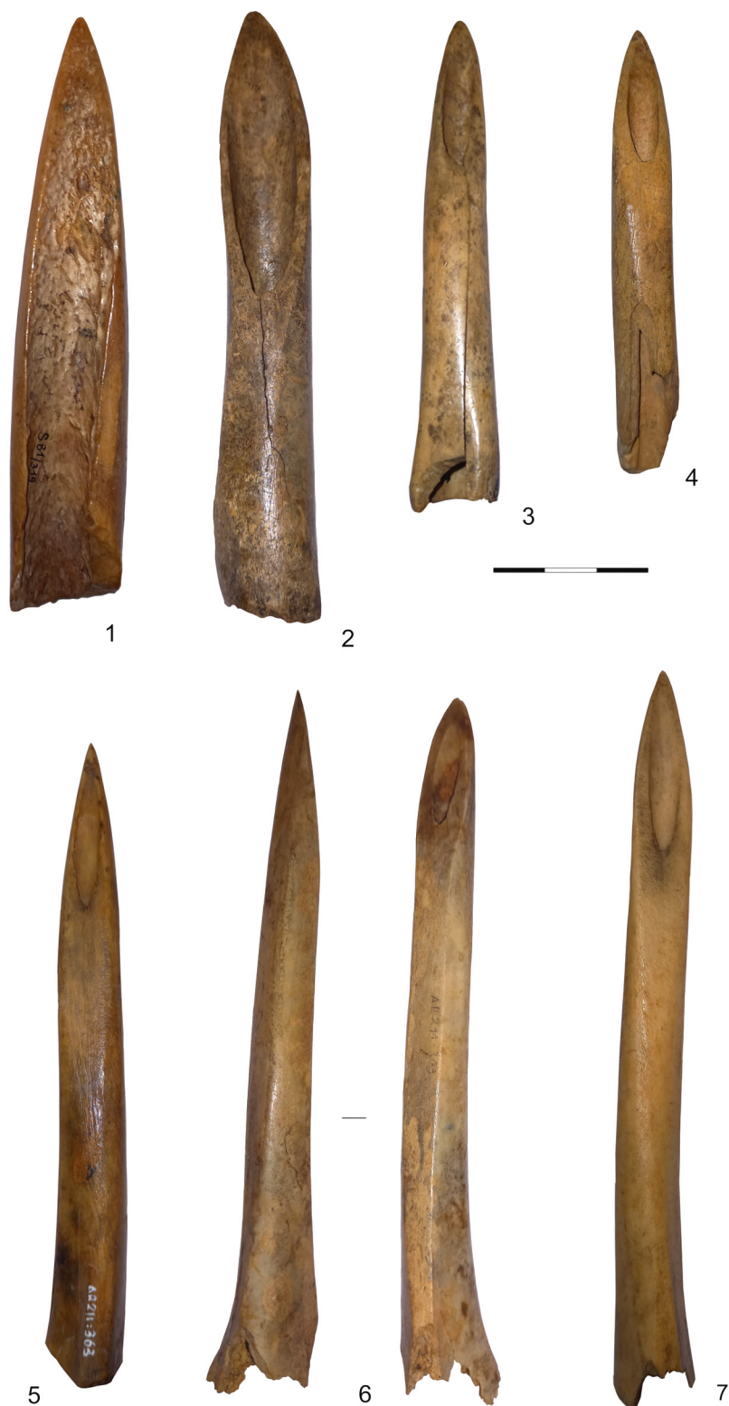
Fig. 8. Spearheads from Sokiškiai. Materials: 1–2 – large ungulate long bone; 3–7 – sheep/goat tibia (LNM AR 211: 508, 165, 483, 304, 363, 309, 302).

8 pav. Iečių antgaliai iš Sokiškių. Naudotos medžiagos: 1–2 – stambių kanopinių ilgieji kaulai; 3–7 – avies / ožkos blauzdi- kaulis (LNM AR 211: 508, 165, 483, 304, 363, 309, 302).