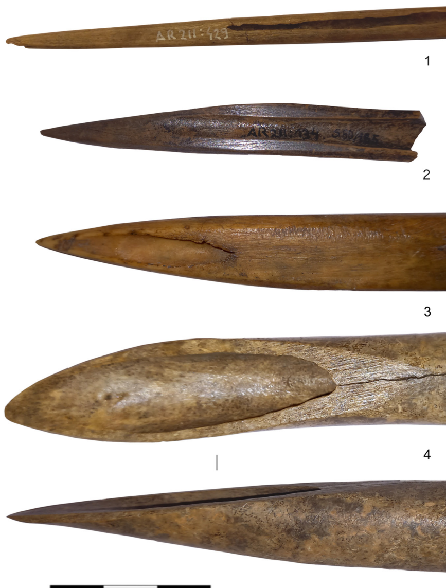
Fig. 14. Working traces on bone objects from Sokiškiai, made of long bones (LNM AR 211: 429, 134, 363, 165).

14 pav. Darbo žymės ant kaulinių dirbinių iš Sokiškių. Dirbiniai pagaminti iš stambių kanopinių gyvūnų kaulų (LNM AR 211: 429, 134, 363, 165). Heidi Luik nuotraukos