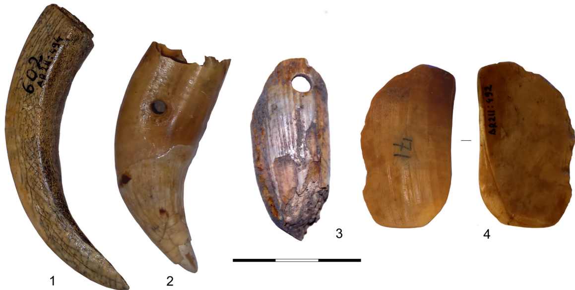
Fig. 2. Teeth artefacts from Sokiškiai (1–2, 4) and Mineikiškės (3). 1 – pig tusk with cut end (LNM AR 211: 494); 2 – bear canine pendant (LNM AR 211: 493); 3 – pig tusk pendant (LNM Mnk 20: 256); 4 – scraper made of pig tusk (LNM AR 211: 492).

2 pav. Dirbiniai iš dantų Sokiškėse (1–2, 4) ir Mineikiškėse (3). 1 – kiaulės iltinis dantis nukirstu galu (LNM AR 211: 494); 2 – kabutis iš meškos iltinio danties (LNM AR 211: 493); 3 – kabutis iš kiaulės iltinio danties (LNM Mnk 20: 256); 4 – gremžtukas iš kiaulės iltinio danties (LNM AR 211: 492).