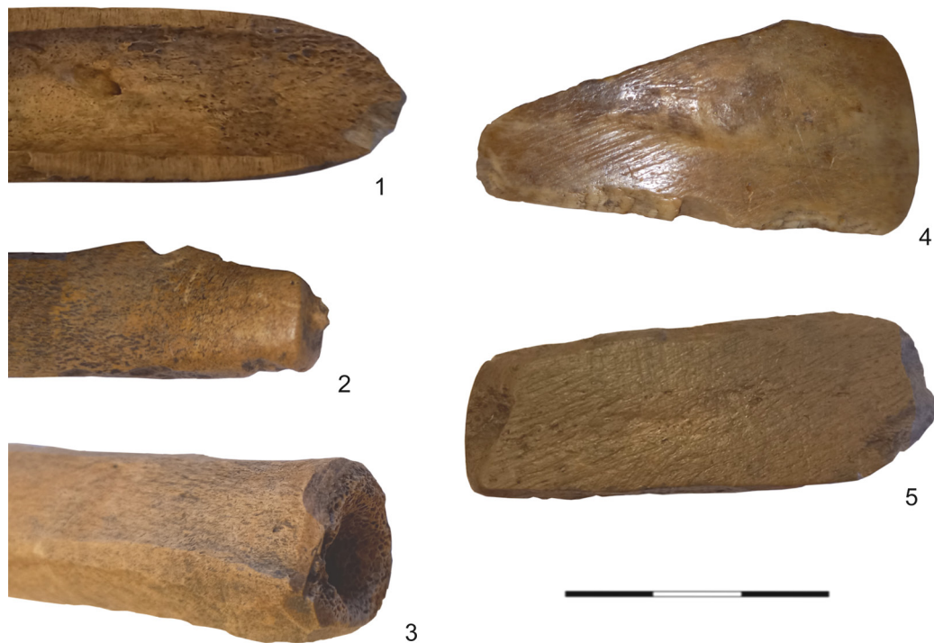
Fig. 13. Working traces on bone objects from Sokiškiai; 1–4 – unidentified long bones; 5 – elk metapodia (LNM RA 211: 274, 371, 384, 282, 489).

13 pav. Darbo žymės ant kaulinių dirbinių iš Sokiškių; 1–4 – nenustatyti ilgieji kaulai; 5 – briedžio metapodija (LNM RA 211: 274, 371, 384, 282, 489).