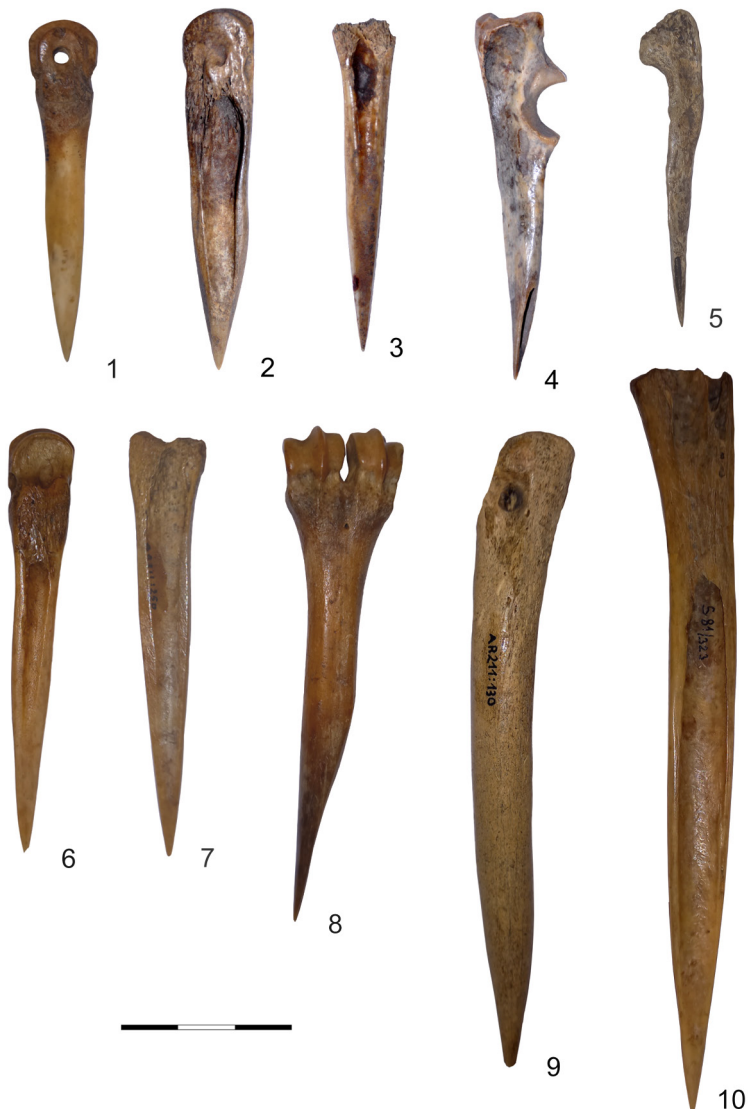
Fig. 6. Bone awls from Sokiškiai (1, 5–10) and Mineikiškės (2–4). Materials: 1, 8 – sheep metatarsus; 2–3, 6 – sheep/goat metapodia; 4 – fox ulna; 5 – hare ulna; 7 – sheep/goat metacarpus; 9 – large ungulate long bone; 10 – sheep/goat tibia (LNM AR 211: 231, LNM Mnk 20: 228, 253, 248, LNM AR 211: 143, 233, 250, 237, 130, 303).

6 pav. Kaulinės ylos iš Sokiškių (1, 5–10) ir Mineikiškių (2–4). Žaliava: 1, 8 – avies pėdos kaulas; 2–3, 6 – avies / ožkos metapodija; 4 – lapės alkūnkaulis; 5 – kiškio alkūnkaulis; 7 – avies / ožkos plaštakos kaulas; 9 – stambaus kanopinio ilgasis kaulas; 10 – avies / ožkos blauzdikaulis (LNM AR 211: 231, LNM Mnk 20: 228, 253, 248, LNM AR 211: 143, 233, 250, 237, 130, 303).