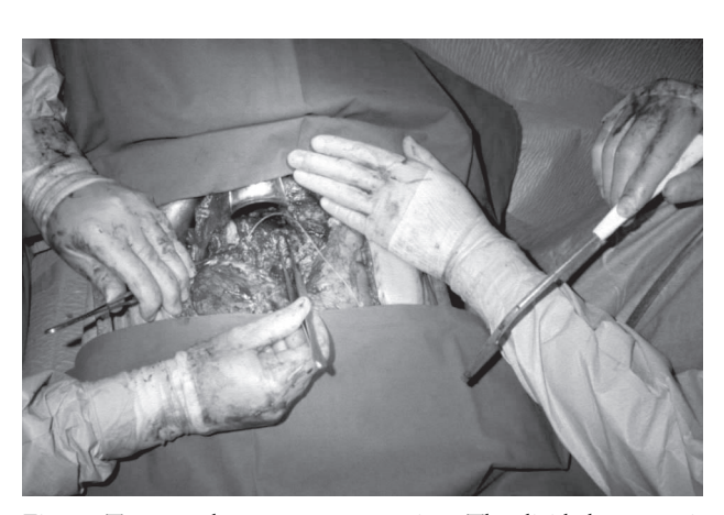
Fig. 3. Transected pancreas at operation. The divided pancreatic tissue edges are pointed with forceps and a pediatric feeding tube has been placed in the pancreatic duct of the proximal stump

Visualization of the entire pancreas requires several maneuvers including transection of the gastrocolic ligament to allow inspection of the anterior surface and inferior border of the gland, and the Kocher maneuver to allow for the exposure of the head and uncinate process of the pancreas. Additional exposure of the superior border of the head and body of the pancreas can be achieved by transection of the gastrohepatic ligament. Finally, lateral mobilization of the spleen and splenic flexure of the colon, and the dissection of the retroperitoneal attachments of the inferior border of the pancreas allows the visualization and bimanual palpation of the posterior surface of the tail and body of the gland [4].