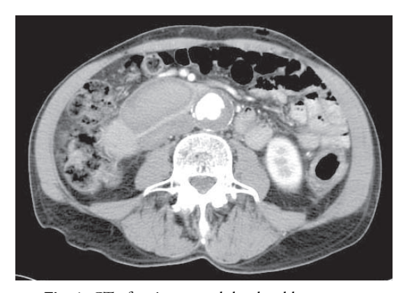
Fig. 1. CT of an intramural duodenal hematoma