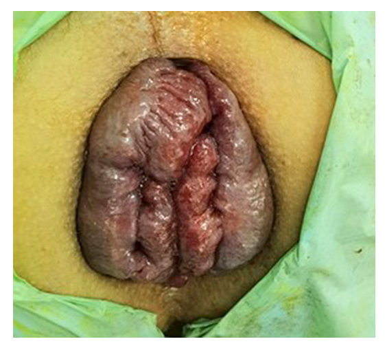
Figure 2. Patient before surgery

Around 15 patients gave information of a feeling of prolapse during defecation and spontaneous reposition with no prolapse visible on examination or with straining. In these patients bleeding or any other symptoms were not present. On anoscopy reduced hemorroidal cushions were present without prolapsing.