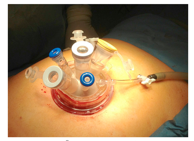
Figure A. QuadPort<sup>®</sup> (Olimpus, Europe Holding GmbH, Hamburg, Germany)

Dissection was performed using ultrasonic dissection (Ultracision ACE<sup>TM</sup>, Ethicon Endo-Surgery, Cincinnati, OH, USA) from the lateral to medial side (the right colon flexure was released from adhesions and mobilized (Figure B), as well as the transverse colon was mobilized up to the middle colic artery). Also, the cecum and terminal ileum were mobilized identifying the right ureter (Figure C). High ligation of the ileocolic and right colic vessels was performed intracorporally. The right colon with the terminal ileum was grasped while the port device was removed and the bowel was extraperitonised (Figure D). Bowel resection and ileotransversostomy with the end-to-side anastomosis was performed extracorporeally using a running PDS 3/0 suture. The bowel with anastomosis and port device was reinserted into the abdominal cavity. The pneumoperitoneum was restored, the abdominal cavity was explored for the possible bleeding. Finally, the port device was removed, and an aponeurosis was closed with absorbable sutures; skin was closed with nonabsorbable