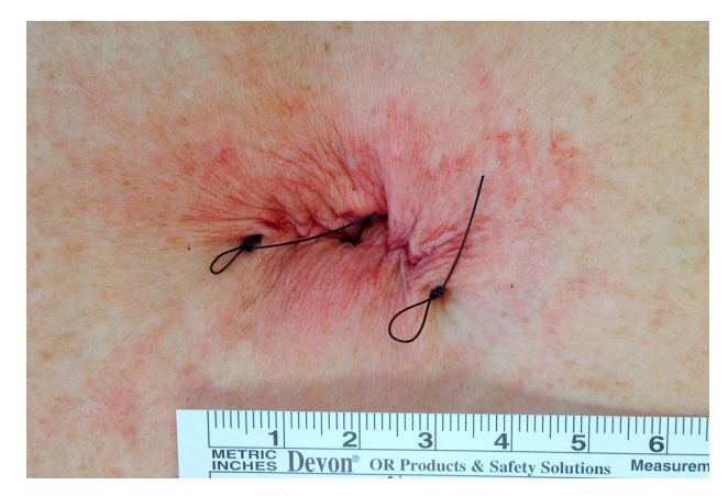
Figure E. The wound after the operation

intracutaneous suture (Figure E). No drains were left intra-abdominally.