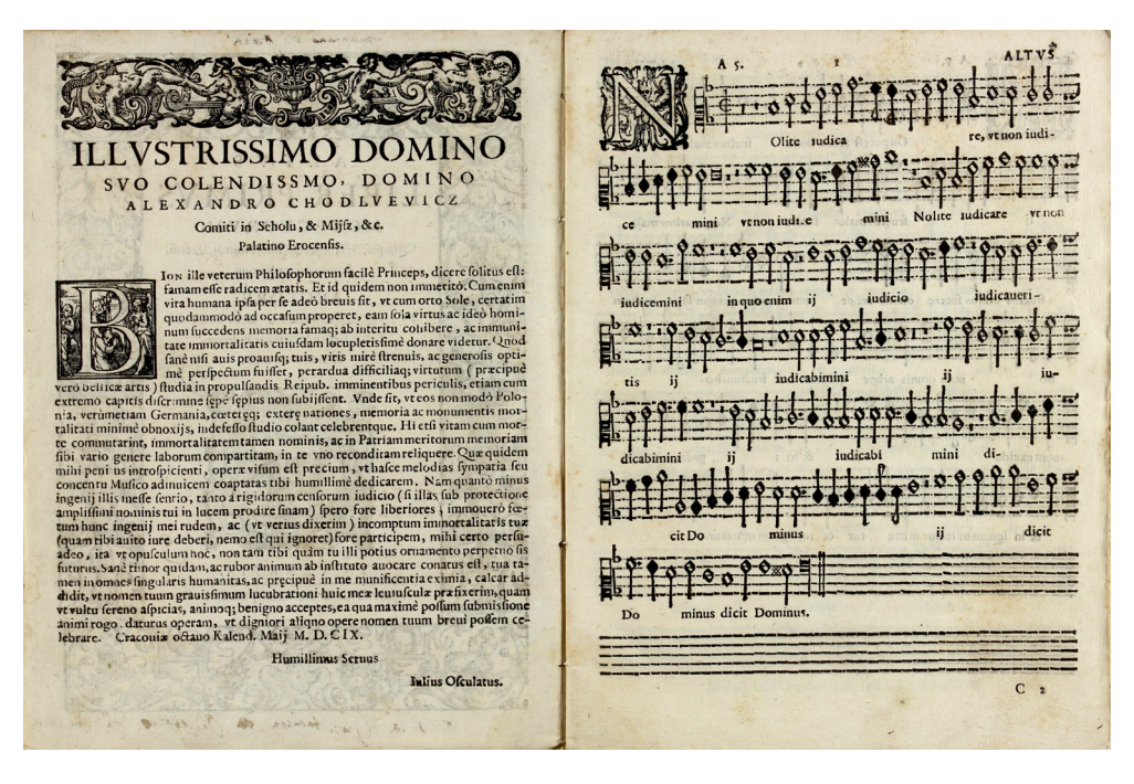
Figure 3: Giulio Osculati, Liber primus motectorum , Venice, 1609; sign BB.64, unita 5, two-page view of the dedication and alto part of the motet Nolite iudicare . From the collections of the Museo Internationale e biblioteca della musica di Bologna.

Aleksander Chodkiewicz accompanied his younger brother Jan Karol in the Battle of Kircholm and took part in various other campaigns of the Polish–Swedish War of 1600–1611.<sup>47</sup> However, there are no references to any particular historic events in this dedication because it aimed to represent the dedicatee rather than inform about his merits. It tells about his long and respectable pedigree, good reputation, his merits in the defence of his country, and his contribution to the Republic's welfare. The state is inevitably implied whenever it comes to praising a public figure.