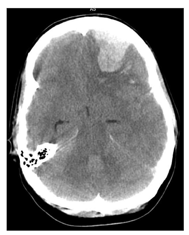
Fig. 2. Hematoma in the left frontal lobe is of similar size (3.5\times3.4 \text{ cm}) , the amount of hemorrhagic content in the ventricles increased, perifocal edema is present, and subarachnoid hemorrhage (SAH) in the right fronto-temporoparietal region appeared. The midline structures are dislocated to the right ~1.0 cm.

(Fig. 3). The patient underwent emergency unilateral decompressive craniotomy which confirmed cerebral infarction due to cerebral venous thrombosis with hemorrhagic ischemic stroke transformation on the left frontal lobe. After the operation, the patient was transferred to the Neuro-ICU; 6 hours after surgery, head CT scan showed no major postoperative changes, transcranial Doppler ultrasound showed no signs of intracranial hypertension.