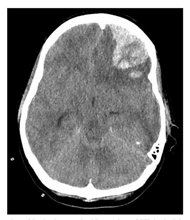
Fig. 1. Massive intracerebral hemorrhage (ICH) in the left frontal lobe (3.5 \times 3.4 \text{ cm}) with a breakthrough into the ventricular system and subdural space. The midline structures are dislocated to the right ~0.63 cm.

One and a half hours after admission to the ER, the patient's condition deteriorated to GCS 9 (E-3, V-1, M-5). Rapid sequence induction was performed with intravenous fentanyl, propofol, and rocuronium. The patient was intubated, mechanically ventilated, and transferred to the general intensive care unit (ICU) until her SARS-CoV-2 RNA PCR was confirmed negative, after which she was