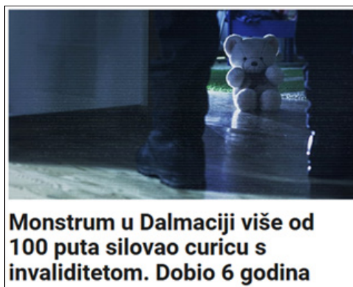
Fig. 8. Headline: Monster in Dalmatia raped disable girl over 100 times. Gets 6 years (index.hr, 08.03.2024)

When it comes to headlines related to crime, the image tends to represent the crime location/place or a symbolic relation to the nature of the crime. For example, a Croatian headline about a case of child sexual abuse is accompanied by a dark image of a male's legs and a white teddy bear in focus, thus symbolically conveying different power positions and creating a threatening mood in line with the lexical choices in the headline ( monster, raped, disabled girl ) (Fig. 8).