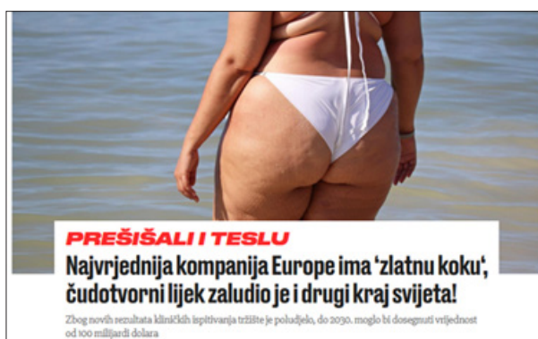
Fig. 5. Headline: SURPASSING TESLA: Europe's most valuable company has a 'golden goose', the other side of the world latches onto the miracle drug! Due to the new results of clinical trials, the market is going crazy, by 2030 it could reach the value of 10 billion dollars (jutarnji.hr, 09.03.2024)

While much of the corpus exhibits a direct connection between the theme of the written text and the accompanying image, there are some occurrences of image-verbal thematic mismatch, mainly in Croatian headlines. Typically, images at least vaguely hint at the topic or provide a symbolic framing for the written text to raise curiosity. However, one headline in the Jutarnji list stands out in its manipulative image-to-text discrepancy (Fig. 5). It shows a sexist depiction of a woman's buttocks, while the headline itself has no apparent logical connection to the image. Even though the headline is packed with verbal and visual information, it is informationally incongruous and incomplete, creating many narrative gaps, and the image-to-text discrepancy works as a clickbait strategy.