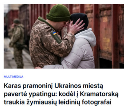
Fig. 3. Headline: The war made the industrial city of Ukraine special: why photographers of the most famous publications are drawn to Kramatorsk (delfi.lt, 01.03.2024)

rare in Croatian headlines, which reveals a more distant relationship with this military conflict. Related to that is the depiction and contextualisation of political leaders in the images, especially V. Putin, who wears a business suit even in military-themed images in Lithuanian headlines. In contrast, Croatian headlines depict him in a military uniform (Figs. 4 and 7 below).