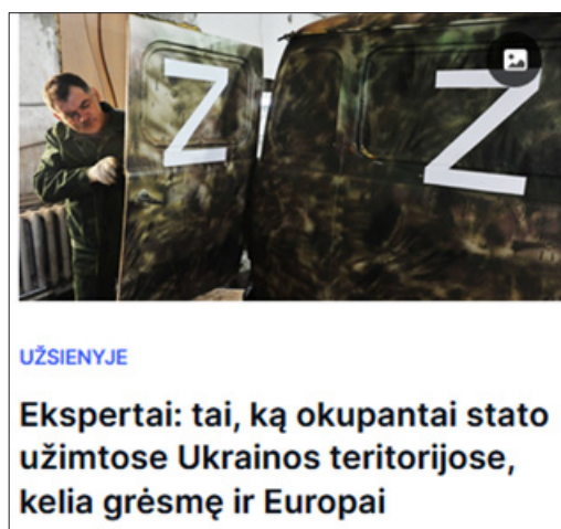
Fig. 6. Headline: Experts: What the occupiers are building in the occupied territories of Ukraine poses a threat to Europe as well (delfi.lt. 03.03.2024)

Symbolism conveyed by the images in the headlines reveals significant socio-cultural meanings and works as another effective way to draw readers' attention. The use of symbolic allusions in the images helps to maintain the "secrecy" of the message and, in most cases, is only related to the broader context of the topic in the headline. For example, images of military equipment, ammunition and soldiers symbolically express military power and state control. Hence, they are incredibly abundant in headlines that mention lexical units such as war , rocket , battle , defence , NATO , military , hostility , combat , weapons , threat , etc. A good example is the use of the letter Z, symbolising Russia's military power and support for V. Putin's invasion of Ukraine, accompanying a headline that frames a dooming narrative about the broader threat of Putin's military occupation of Ukraine (Fig. 6).