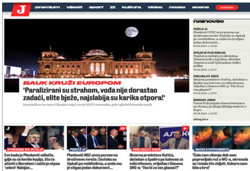
Fig. 1. Front page of jutarnji.hr (05.03.2024)