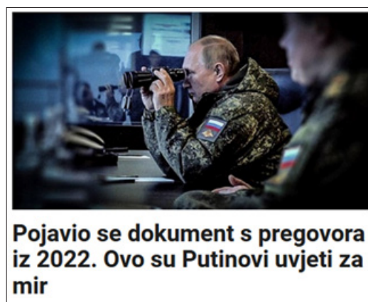
Fig. 4. Headline: Document emerges from 2022 negotiations. These are Putin's terms for peace (index.hr, 02.03.2024)

rare in Croatian headlines, which reveals a more distant relationship with this military conflict. Related to that is the depiction and contextualisation of political leaders in the images, especially V. Putin, who wears a business suit even in military-themed images in Lithuanian headlines. In contrast, Croatian headlines depict him in a military uniform (Figs. 4 and 7 below).