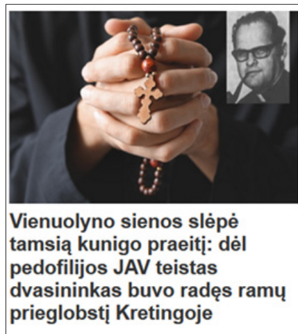
Fig. 9. Headline: Monastery walls were hiding this priest's dark past: the priest convicted of pedophilia in the US had found a peaceful shelter in Kretinga (lrytas.lt, 10.03.2024)

In sum, the accompanying images of headlines reinforce the verbal message of the headline overall. They are widely used to supplement clickbait messages with visual information and convey a certain value or emotional context. Images are intended to allude or hint at certain scenarios and convey an anxiety-inducing and intense tone, especially related to the war in Ukraine or the topic of crime, encouraging readers to click and read the article for more detailed information.