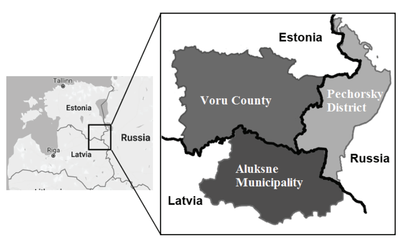
Fig. 1. Case study

The author has chosen a case study approach. Two case studies in the Latvian-Estonian-Russian border have been selected – Aluksne Municipality in Latvia as the main case and Voru County in Estonia as a complementary case (see Fig.1). The author carried out fieldwork in the Latvian-Estonian-Russian border area between May 2016 and August 2018. Both selected cases are located in the border area and in the rural territory in periphery of the country. Both territories have direct access to the internal border of the EU (the Latvian-Estonian border), as well as to the external border of the EU (the Latvian-Russian border).