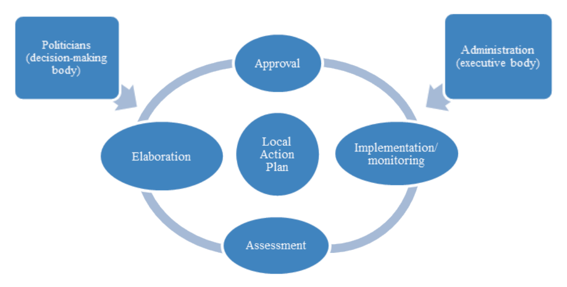
Fig.3. Scheme of researching and promoting well-being methodology in municipalities